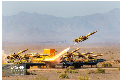
Figure 4. Iranian drone exercise in 2022.