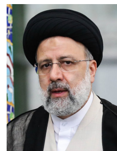
Figure 2. Iranian President Ebrahim Raisi