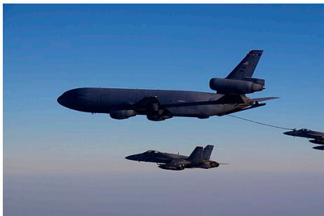
Figure 3. F/A-18 Hornets and Super Hornets conduct in-flight refuelling with a U.S. Air Force KC-10A Extender.

This analysis is subject to evolving developments in the region, and further updates may be warranted.